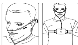
Figure 3-Cannula placement